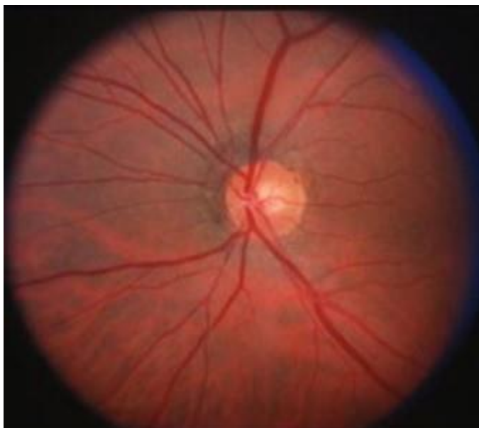
Fig. 1: Normal optic nerve.

See Figure 1, which shows a normal optic nerve with an orange-pink circle and a yellow-white center. See Figure 2, which shows a nerve with a pit. There is an extra area of lighter color at the bottom of the orange-pink circle; this is the pit.